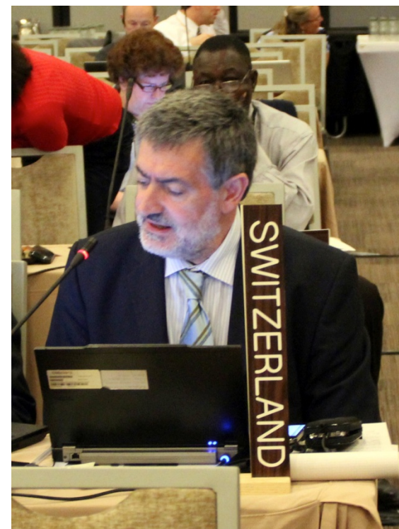
IPBES CH meeting, 15. Nov. 2012

Science and Policy Platform of the Swiss Academy of Sciences Swiss Biodiversity Forum