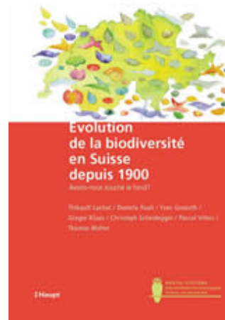
Book: “Evolution of BD in Switzerland since 1900” in 2010

The Swiss Biodiversity Strategy has been adopted by the Federal Council in April 2012. An action plan has to be developed within 24 months.