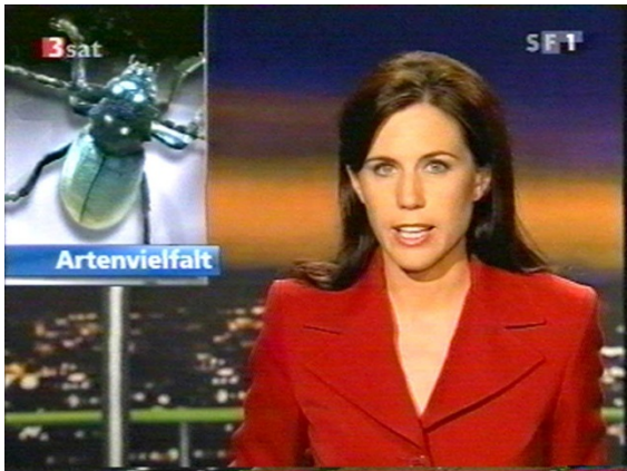
Biodiversity in the media: 10 vor 10, in 2004