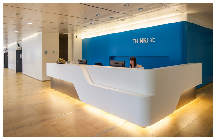
IBM Research THINKLab – Zurich Your door to IBM Research in Europe