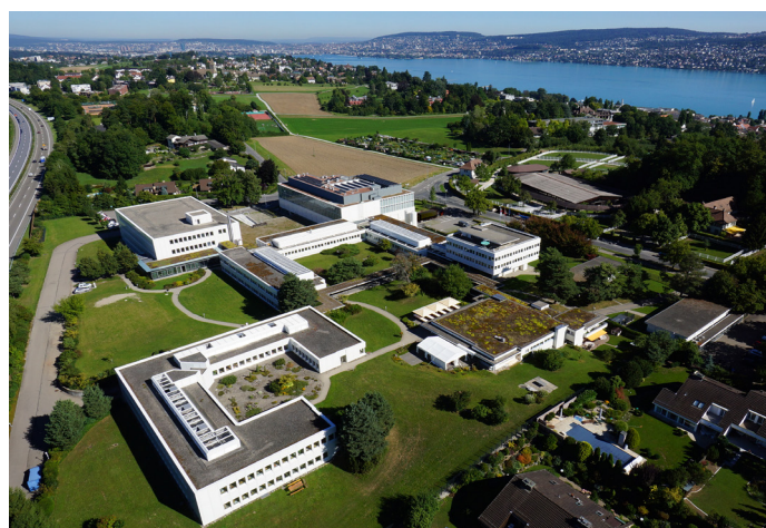
Campus of IBM Research – Zurich

This think-tank is part of the European IBM Client Center network. It gives companies, academia and governments the opportunity to learn how IBM's R&D assets, trend research, advanced technologies and solutions can enhance their success. It is also the place where clients can get first-hand experience with innovative prototype solutions.