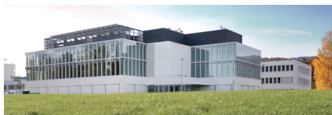
Binnig and Rohrer Nanotechnology Center

A new facility for collaborative nano-scale research was opened on the IBM Zurich campus in 2011. The Binnig and Rohrer Nanotechnology Center ( top right ) is part of a strategic partnership in nanosciences with ETH Zurich, one of the world's foremost science and engineering universities.