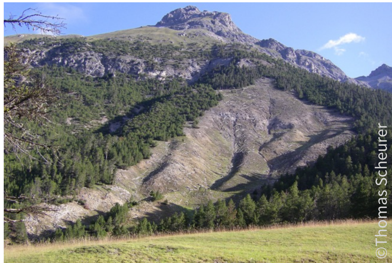
Fig 1: The burnt area at il Fuorn in SNP