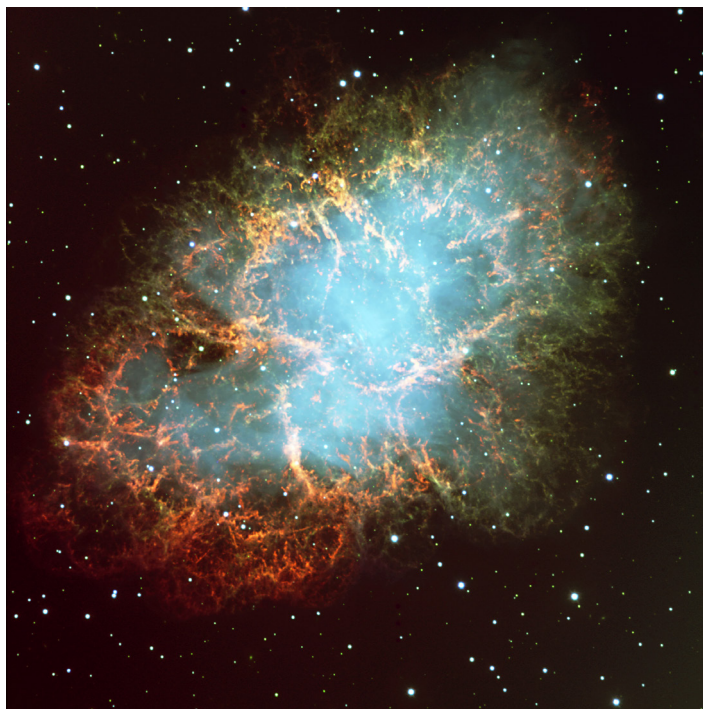
The Crab Nebula in Taurus (VLT KUEYEN + FORS2)