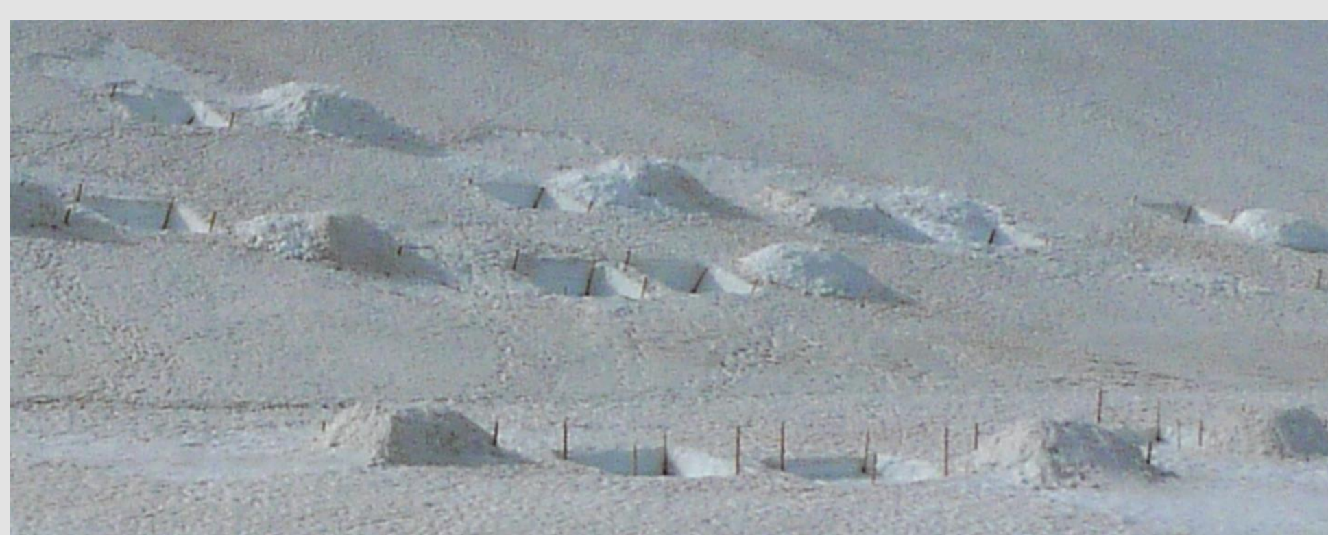
Field site with the snow cover manipulation at 2500 m a.s.l.