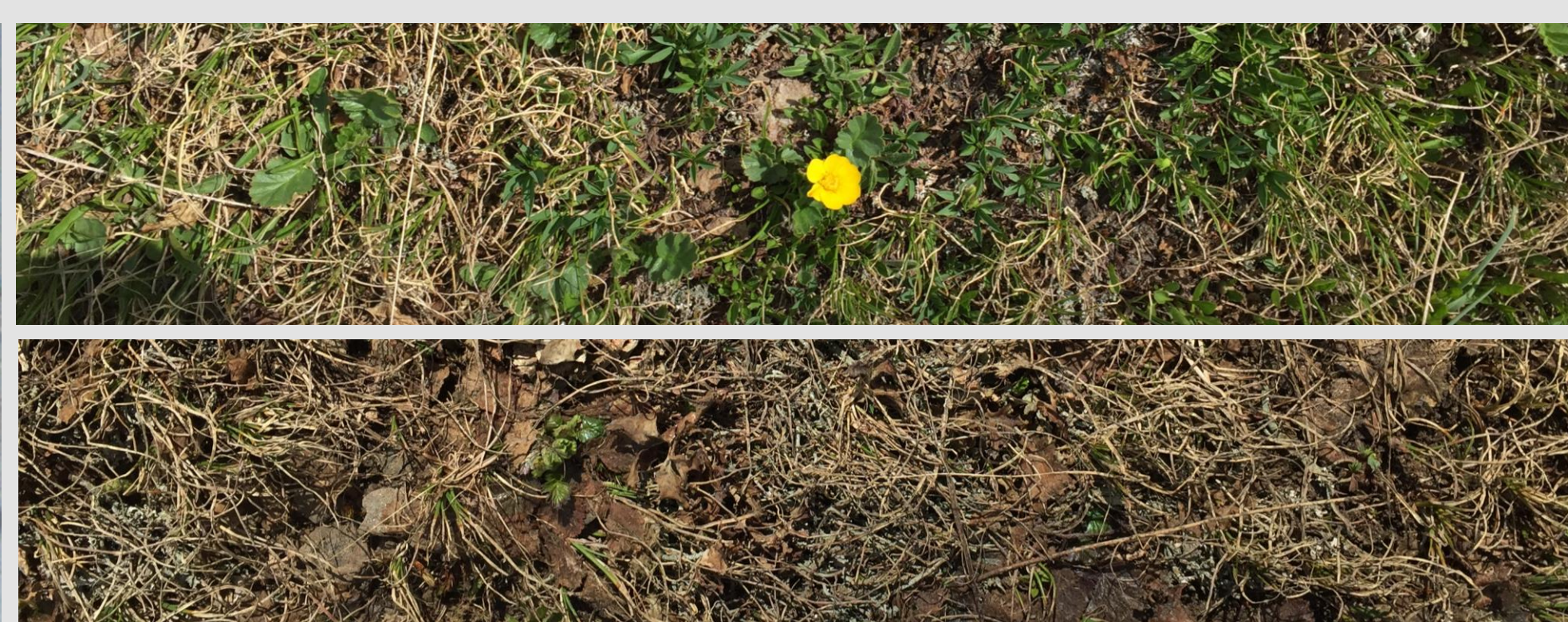
A snow removal (top) and a snow addition (bottom) plot on July 8 th , 2016